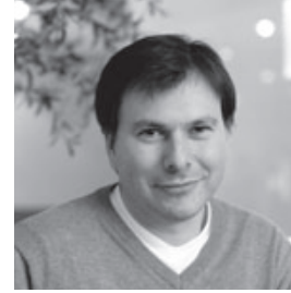
Simon Anholt , Thinker

There are many ways of looking at the progress of countries, but we always focus on domestic performance, as if countries were islands. Even though we know they’re not. In the age of globalisation, everything we do and make has costs and consequences way beyond our national borders. Simon Anholt has helped more than fifty countries engage more productively with the rest of the world, and his latest project, the Good Country Index, is the first to measure exactly how much each country contributes (or borrows, or steals) from the planet and from humanity. This „national balance sheet“ is his recipe for making governments more accountable for the way the whole world works. He will be presenting the first results exclusively at the TEDSalon.