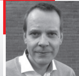
Hans and Ola Rosling, Ignorance fighters

The tagline of Hans and Ola Rosling's Gapminder Foundation is „Unveiling the beauty of statistics for a fact-based world view.“ From their base in Stockholm, Sweden, Hans (one of the most popular TED speakers) and his son Ola have been using technology, analysis and wit to challenge and change the way we look at notions such as „development“ and „poverty.“ As advocates of democratizing access to statistics they are now engaged in a campaign against ignorance -- against the lack of essential knowledge that fills our world view with misconceptions. Their Ignorance Project, led by Ola, highlights the public ignorance of global development through large representative questions about global facts.