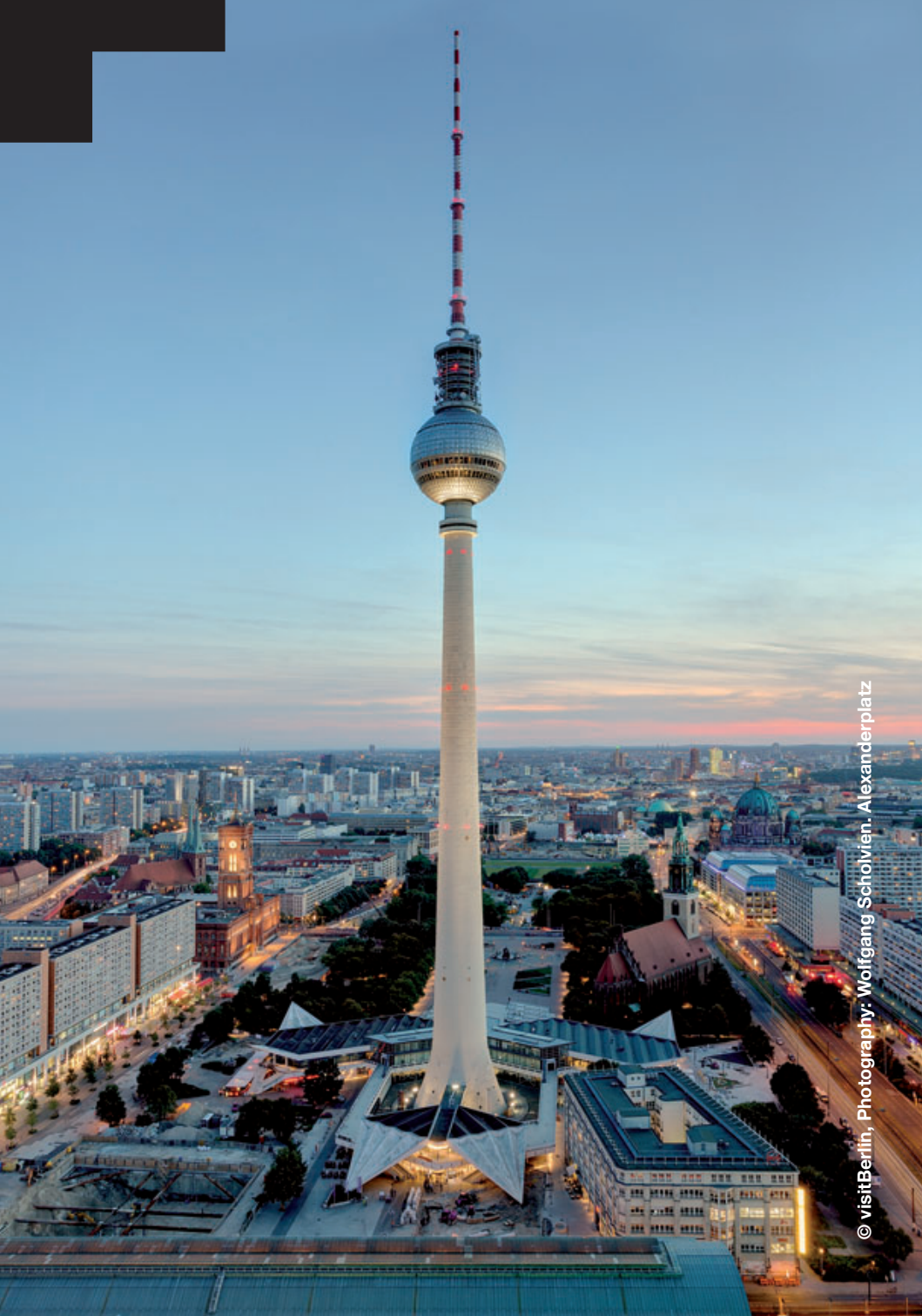
© visitBerlin, Photography: Wolfgang Scholvien, Alexanderplatz